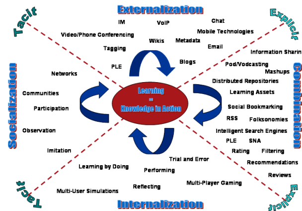
Figure 2. SECI model based learning process

Learning and knowledge management are increasingly similar in terms of input, outcome, processes, activities, components, tools, concepts, and terminologies and can thus be viewed as two sides of the same coin. Nonaka and Takeuchi adopt a dynamic model of knowledge management, view knowledge as activity rather than object and focus on knowledge creation, collaboration and practice. This knowledge creation model has been referred to as the SECI model.